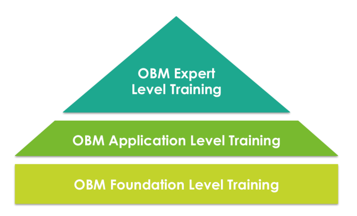
Figure 1: OBM Dynamics pathway. Application & Expert levels under development.

OBM training and certification is applicable to anyone with a responsibility for improving individual and team performance, including leaders, managers, consultants and human resources professionals.